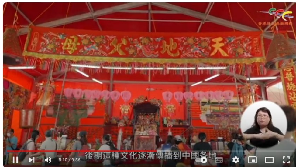
無障礙賞非遺2 香港潮人盂蘭盛會 (附手語翻譯及口述影像)

https://www.youtube.com/watch?v=W_0QPMzRJks