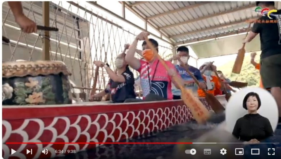
無障礙賞非遺(1) 大澳端午龍舟游涌 (附手語翻譯及口述影像)

https://www.youtube.com/watch?v=Xm5W9O5Htho