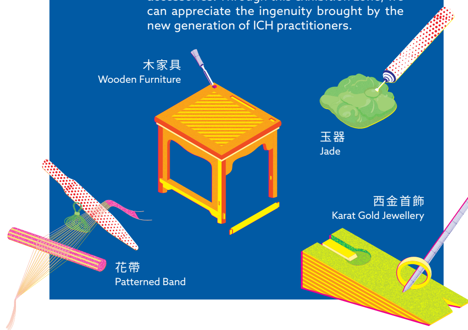
木家具 Wooden Furniture

Decorations are an essential element in embellishing people's lives. Wood can be turned into a piece of useful furniture under plane and chisel; cotton threads can be woven into colourful and vivid bands; jade can be engraved into incredible ornaments through sculpting; and pieces of metal can be meticulously chased and polished into shiny accessories. Through this exhibition zone, we can appreciate the ingenuity brought by the new generation of ICH practitioners.