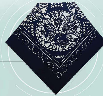
藍印花布印染技藝 Indigo-dyed Cloth Printing and Dyeing Techniques