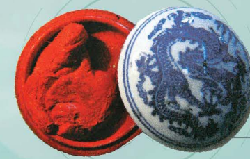
西泠印泥製作技藝 Xiling Seal Paste Making Technique