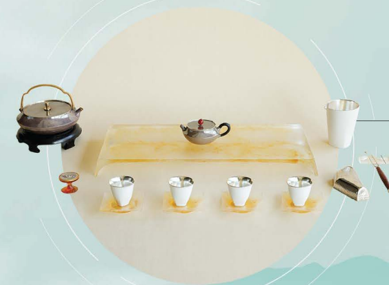
杭州傳統銀茶酒器製作技藝 Making Technique of Traditional Silver Tea and Liquor Ware of Hangzhou