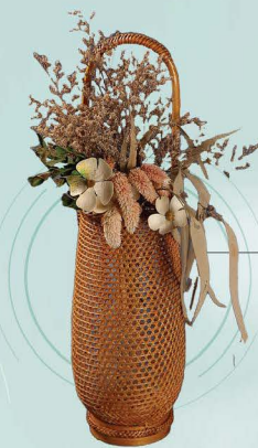
嵯州竹編 Shengzhou Bamboo Weaving