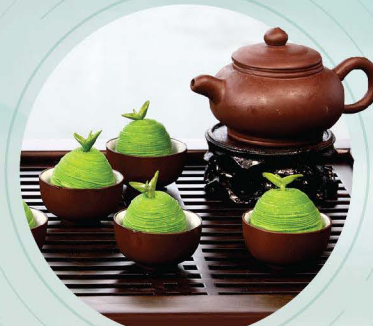
杭州知味觀 傳統點心製作技藝 Traditional Tea Cake Making Technique of Hangzhou Zhiweiguan