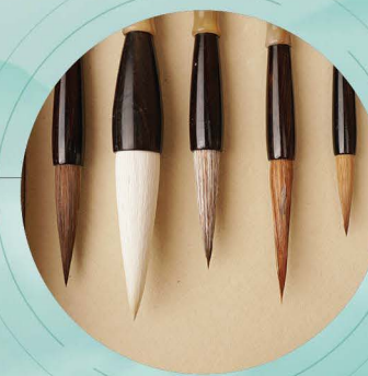
湖筆製作技藝 Huzhou Writing Brush Making Technique