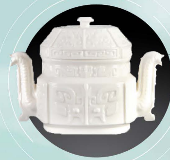
婺州窯衢州白瓷燒製技藝 Firing Technique of Quzhou White Porcelain of Wuzhou Kiln