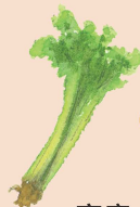
芹菜 Chinese Celery

Symbolic meanings of the auspicious objects tied under the “newborn son” lantern: