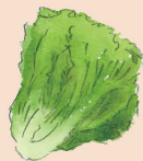
生菜 Chinese Lettuce