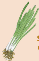
蔥 Spring Onion